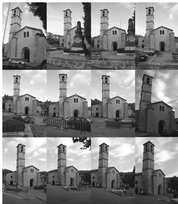
Figure 2: Twelve pictures of the Valbonne Sequence

There are as yet no standardized data sets for testing wide baseline matching algorithms. However, there is one data set that has been used in a number of wide baseline matching papers (Schaffalitzky and Zisserman, 2002, Ferrari et al., 2003, Martinec and Pajdla, 2002), which is the Valbonne church sequence as shown in Figure 2.