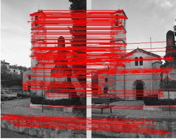
Figure 1: The matching corners for two views