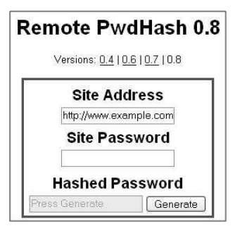
Figure 1: Remote web site for generating PwdHash passwords

@ @ character, processing so-designated passwords, and replacing the input, before JavaScript would have access. PwdHash also protects against phishing attacks by using a hash salt based on the domain name of the target web site. If users enter their password at a fraudulent site, that site's domain will be used as the salt.