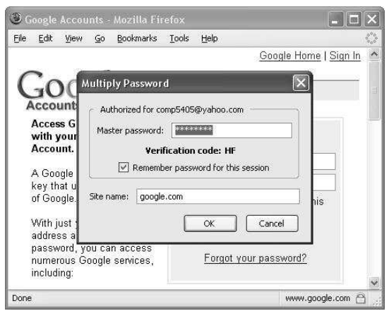
Figure 2: The dialog box for P-Multiplier is activated by double-clicking on the password field

Password Multiplier (hereafter identified as P-Multiplier) is a second password manager intended to help users generate strong passwords for web accounts [11]. It is a plug-in for Mozilla's Firefox web browser, requiring no changes to the servers; all computation is done client-side. As with PwdHash, a cryptographic hash function is applied, generating strong passwords for the user's accounts. While a primary design goal of PwdHash is to protect web site passwords against phishing attacks, P-Multiplier is intended to generate and manage strong passwords from a single user-chosen password for arbitrary passwordprotected applications (i.e, not restricted to web site passwords); this difference does not affect our usability study, and the plug-in we tested is restricted to web site passwords. P-Multiplier uses a master username and master password so that users need only remember one password for all of their accounts. A protected password is generated based on the master username,