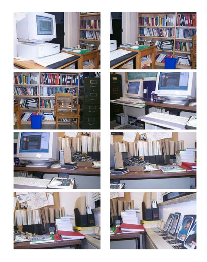
Figure 3: Eight equally spaced images (out of thirty-three) in the room sequence.

In performing our experiments we have drawn some conclusions about the best approaches for each step of the projective reconstruction process. We have also described a new way to locally filter invalid correspondences based on the disparity gradient. We believe that projective methods in combination with random sampling solve the correspondence problem for many image sequences. The support set of the fundamental