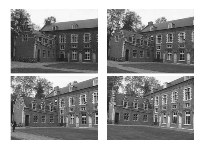
Figure 1: Four images in the castle sequence.

We have performed a number of experiments in which we automatically compute the correspondences for a sequence of images using the projective paradigm. We have noticed that the photogrammetric bundle adjustment software will sometimes not converge if the spacing between the image sequence is too small. For this reason we manually skip images in a sequence to maintain an average disparity of at least twenty pixels.