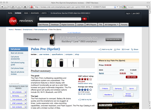
Figure 2: Original CNET page.

Listing A: JavaScript code used to change the CNET rat-