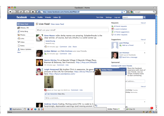
Figure 4: Homepage for a logged-in Facebook user

The attack code, as shown in Listing A, needed to gain access to the tag with the id "edStars." However, in Figure 3 the review stars are contained within a visual policy box, meaning they are protected from other parts of the page. Similarly, the advertisement where the attack code